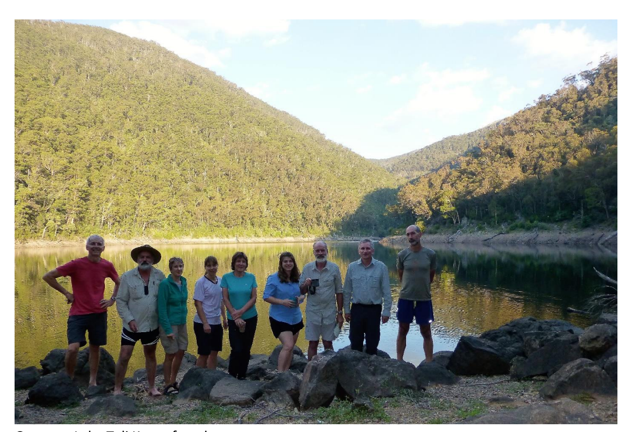
Group at Lake Tali Karng foreshore

Email this preview to walkbcwc@gmail.com