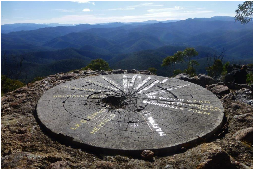
Summit Cairn Ben Cruachan

Recommended meeting point for 4WD participants coming from Heyfield and/or Maffra Intersection of Millers Rd & Huggetts Rd (Use Channel 19 for communications) Noting Road beyond this point may prove confusing for 1 st Timers