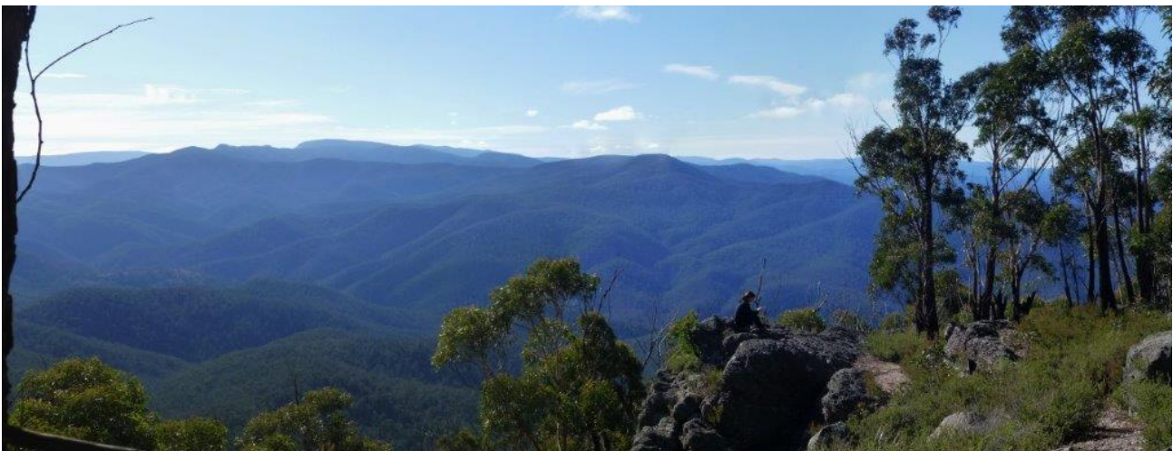
View towards Gable End from Ben Cruachan summit